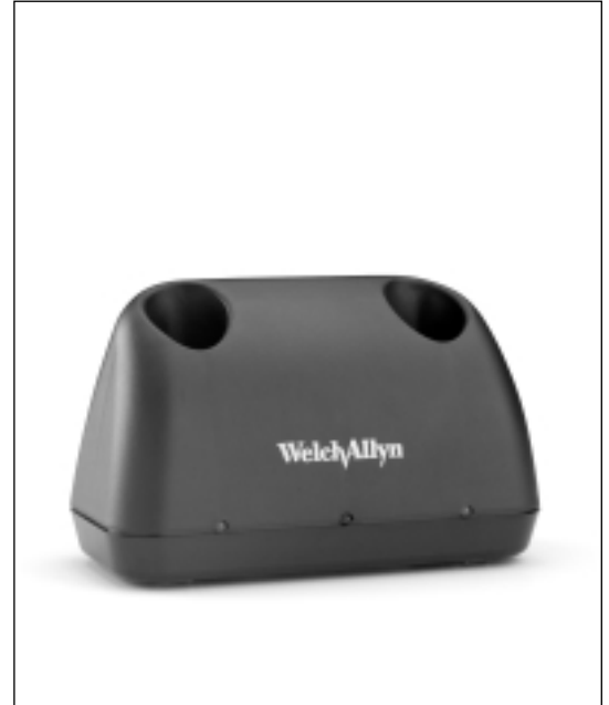
79290 Universal Desk Charger (Heads and Handles Sold Separately)

*For appropriate product number outside of U.S.A., please advise country and voltage required when ordering.