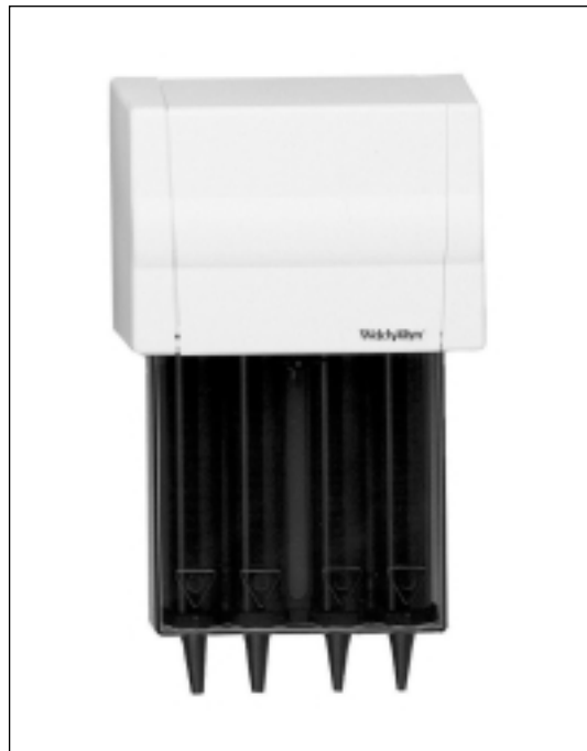
KleenSpec Dispenser With Storage Compartment

*Sold to distributor in case quantity only (10 ea./case)