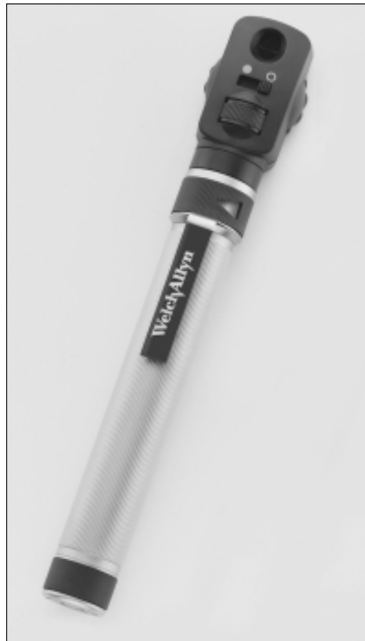
2.5v PocketScope Ophthalmoscope

*For appropriate product number outside of U.S.A., please advise country and voltage required when ordering.