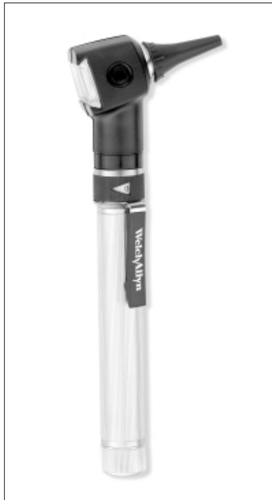
2.5v PocketScope Otoscope

Welch Allyn will repair or replace, free of charge, any parts of its own manufacture proven to be defective through causes other than misuse, neglect, damage in shipment, or normal wear.