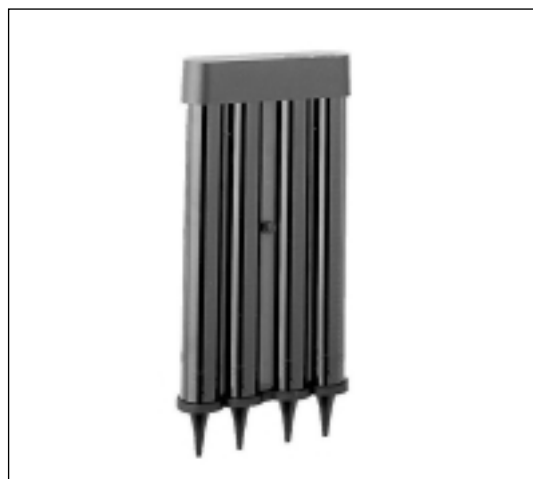
KleenSpec Dispenser With Storage Compartment