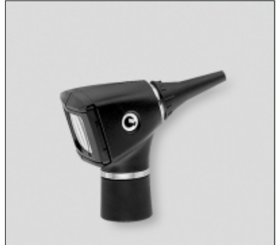
20000 3.5v Diagnostic Otoscope/Throat Illuminator

Welch Allyn will repair or replace, free of charge, any parts of its own manufacture proven to be defective through causes other than misuse, neglect, damage in shipment, or normal wear.