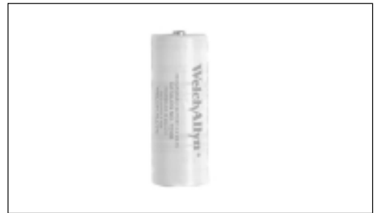
72300 Nickel-Cadmium Battery (included with 71000-A)