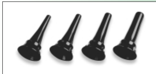
24400 Reusable Polypropylene Otoscope Specula