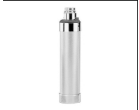
71670 3.5v Rechargeable NiCad Handle

*For appropriate product number outside of U.S.A., please advise country and voltage required when ordering.