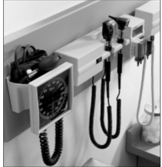
767 Integrated Diagnostic System