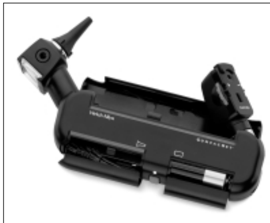
2.5v CompacSet™ Diagnostic Set

*For appropriate product number outside of U.S.A., please advise country and voltage required when ordering.