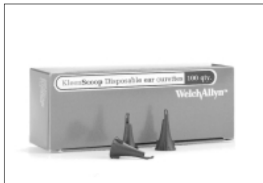
Disposable Cerumen Removal Specula