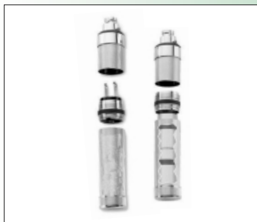
Simply Unthread Plug Module, Remove Ni-Cad Rechargeable Battery, Insert 2 C-Cell Batteries, and Attach Converter Ring