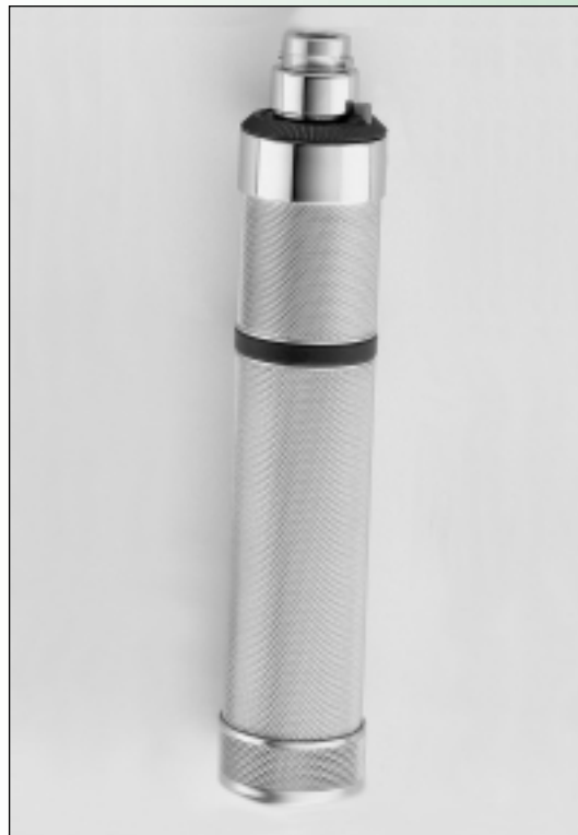
71000-C 3.5v Convertible Rechargeable Handle

*For appropriate product number outside of U.S.A., please advise country and voltage required when ordering.