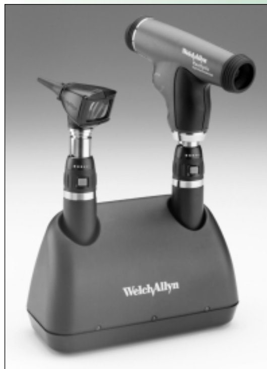
71811-PSM Universal Charger Desk Set

*For appropriate product number outside of U.S.A., please advise country and voltage required when ordering.