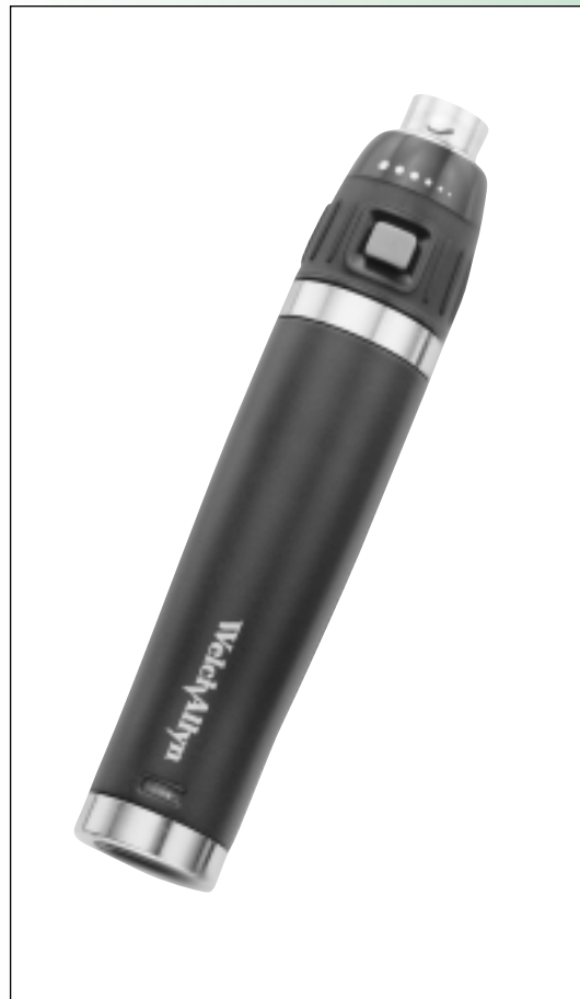
71900* 3.5v Lithium Ion Rechargeable Handle

*For appropriate product number outside of U.S.A., please advise country and voltage required when ordering.