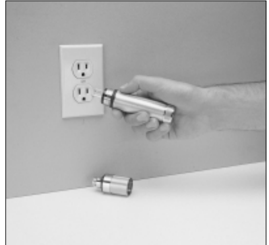
71000-A* 3.5v Direct Plug-in Rechargeable Handle

*For appropriate product number outside of U.S.A., please advise country and voltage required when ordering.