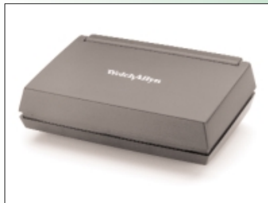
71310 Specula Tray