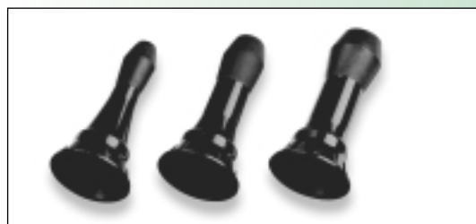
24420 SofSpec Reusable Otoscope Specula