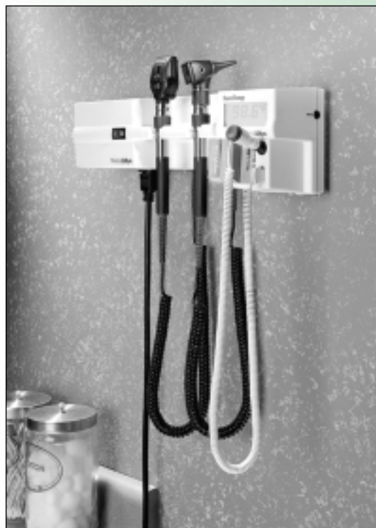
767 Wall Unit with Add-on Components