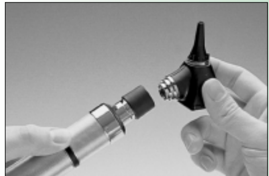
Two Instruments in One: Simply twist otoscope head off to use Throat Illuminator/Penlight (Handle Sold Separately)