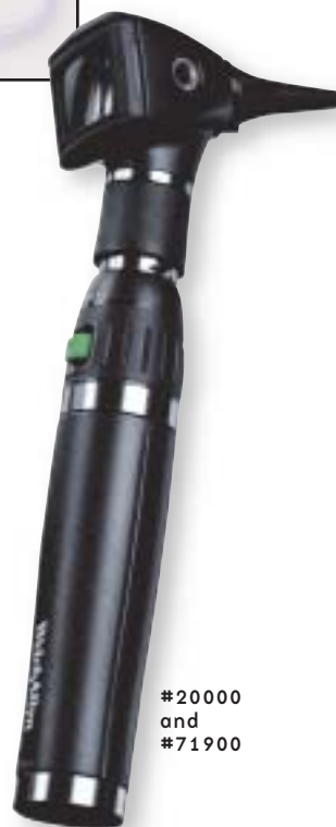
#20000 and #71900