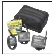
Pediatric Multi-Cuff Kit components shown